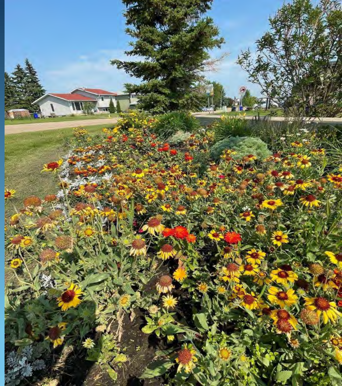
Native plants at Brookside Entrance October 2023