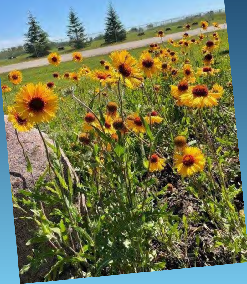
Native plants at Interpretive Center

Native plants, flowers and trees integrated into the gardens. Bruderheim is involved in a climate adaptation program as part of Resilient Rurals.